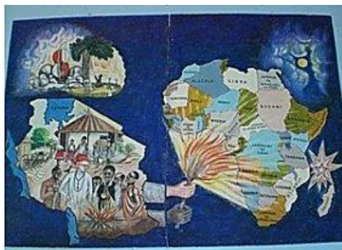
The fire of peace coming from Tanzania is contaminating the whole of Africa, dispelling the forces of darkness. You will notice a White Father contributing to care of the fire. The dear wish from the father of the nation is here depicted on a fresco from the artist Charles Ndege, within the walls of the archive building of the Sukuma cultural centre, Bujora within the area of Mwanza (Tanzania).

Many development projects drawing inspiration from these aspirations are initiated every year when the torch goes around the country.